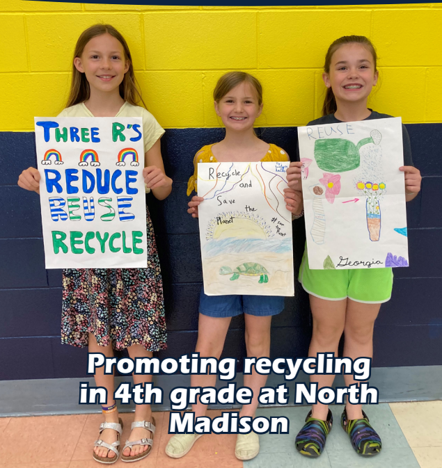
Promoting recycling in 4th grade at North Madison