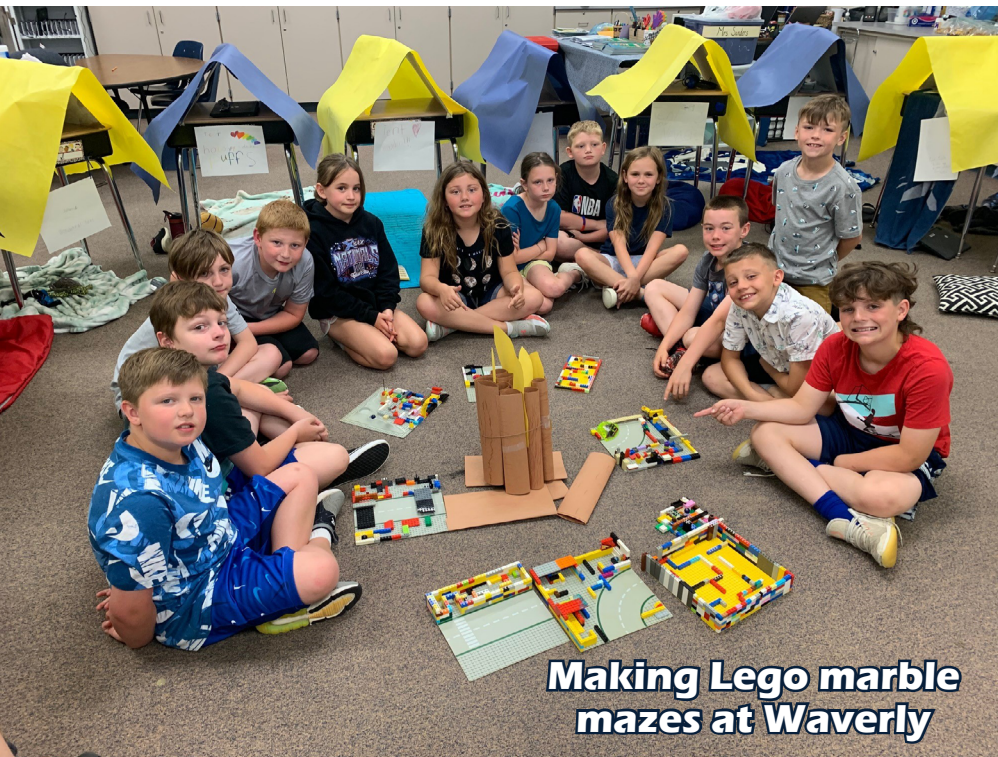
Making Lego marble mazes at Waverly