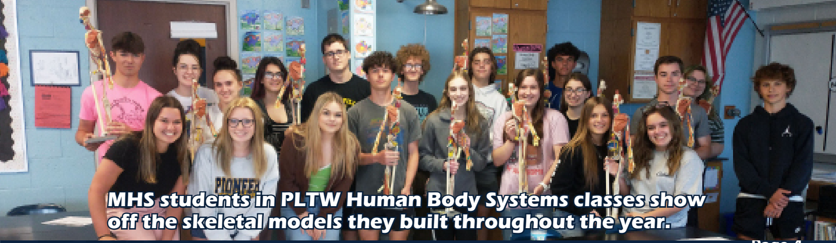
MHS students in PLTW Human Body Systems classes show off the skeletal models they built throughout the year.