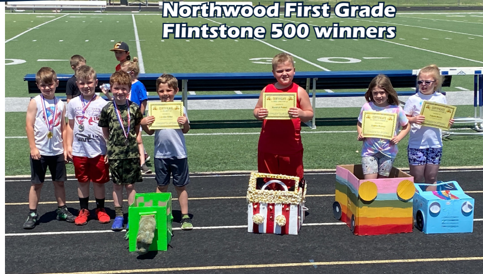
Northwood First Grade Flintstone 500 winners